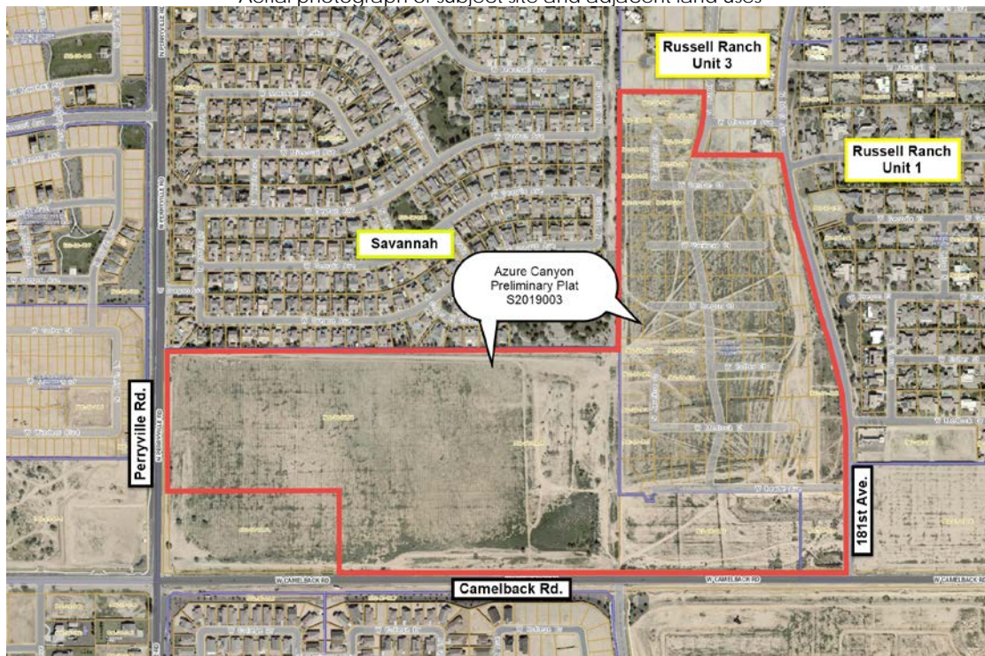
Aerial photograph of subject site and adjacent land uses