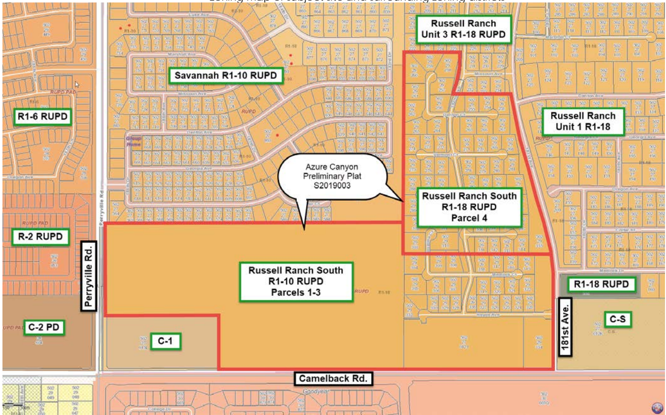
Zoning map of subject site and surrounding zoning districts