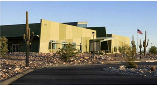
White Tank Library and Nature Center